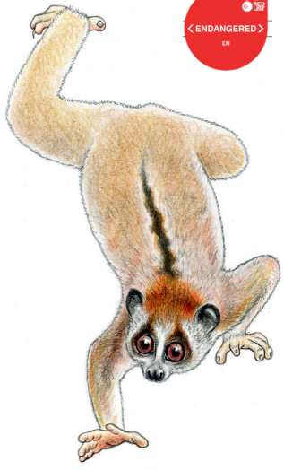
Southern Pygmy Loris Xanthonycticebus pygmaeus

Southern Vietnam, southern Laos, southern China and eastern Cambodia