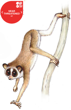
Malabar Grey Slender Loris Loris malabaricus