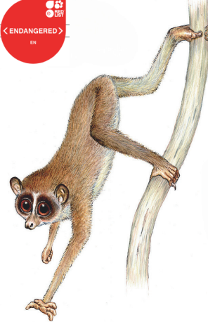
Red Slender Loris Loris tardigradus