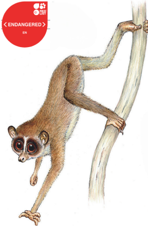
Red Slender Loris Loris tardigradus