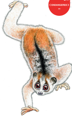
Northern Pygmy Loris Xanthonycticebus intermedius

Northern Vietnam, northern Laos and southern China