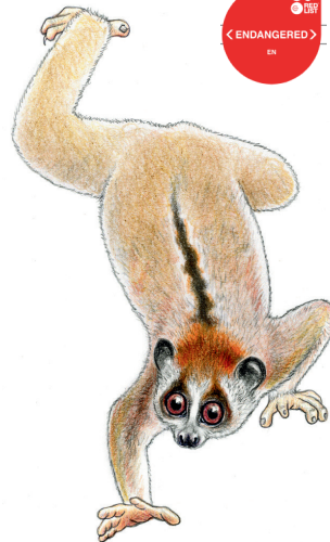
Southern Pygmy Loris Xanthonycticebus pygmaeus

Southern Vietnam, southern Laos, southern China and eastern Cambodia